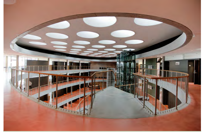
A stunning view from the top floor of Copenhagen Business School's award-winning Kilen building.