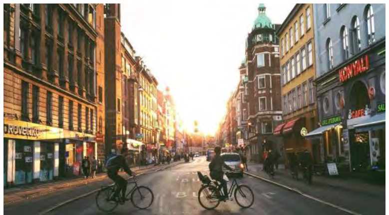
Copenhagen's Nørrebro district has no shortage of activities for adventurous AIB Conference attendees.

Recommended bike rental app: aib.to/2019bike